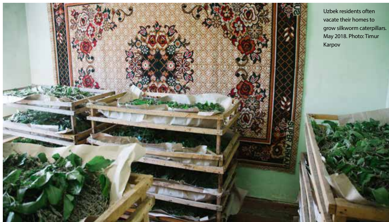
Uzbek residents often vacate their homes to grow silkworm caterpillars. May 2018.