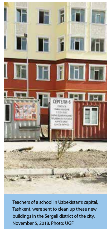
Teachers of a school in Uzbekistan's capital, Tashkent, were sent to clean up these new buildings in the Sergeli district of the city. November 5, 2018.

As this research was being conducted, officials in the Fergana region appeared to have been enforcing policies against forced labor. All eight of the public-sector employees interviewed in the Fergana region in May and June described being forced to work outside their regular jobs until April. All except one said that since the president's order prohibiting forced labor for public-sector workers, their employers had stopped requiring them to participate. 31 One doctor in Fergana said that while some forms of forced labor had stopped since April, some hospital staff, including nurses, continued to be forced to sweep, plant flowers and weed, especially on hospital grounds and in the surrounding area. 32