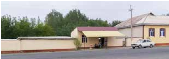
After the adoption of the “Obod kishlok” program, local authorities throughout the country forced residents of houses along main roads, like this one in Navoi Region, to paint their houses yellow. June 11, 2018.

In March 2018, Mirziyoyev announced the Obod Kishlok program to rehabilitate rural housing and infrastructure. In remarks introducing the program, the president scolded “irresponsible” local officials, as well as homeowners and village residents, many of whom live in poverty, for letting housing fall into disrepair. 62 The program emphasizes cosmetic improvements to home exteriors, as well as beautification of the grounds around houses visible to the street. Public employees in the Andijan, Jizzakh, Khorezm, Navoi and Samarkand regions said local officials imposed the burden of the president’s program on public institutions. 63 Employees provided consistent accounts of the program’s implementation: the hokim assigned responsibility for specific villages to specific public institutions. Small groups of employees were then assigned to convince the owners of 10–15 houses at a time to fix up their homes according to specifications or do the work and pay for materials themselves. This included repairing the exterior wall and gate of each house, installing drywall, painting the outer wall and foundation red or yellow, whitewashing tree trunks and ensuring the grounds were weeded and planted. 64