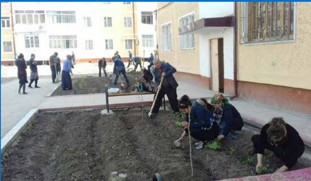
Teachers in Andijan region were forced to do maintenance work cleaning public spaces in advance of a visit from Uzbek President Shavkat Mirziyoyev. April 5, 2018.