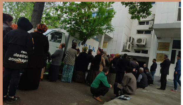
Bread queue in Ashgabat

The increase in fees means bankruptcy for them.