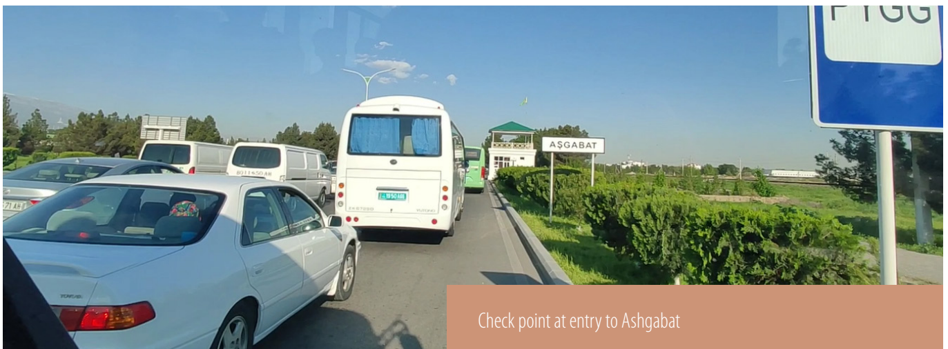
Check point at entry to Ashgabat