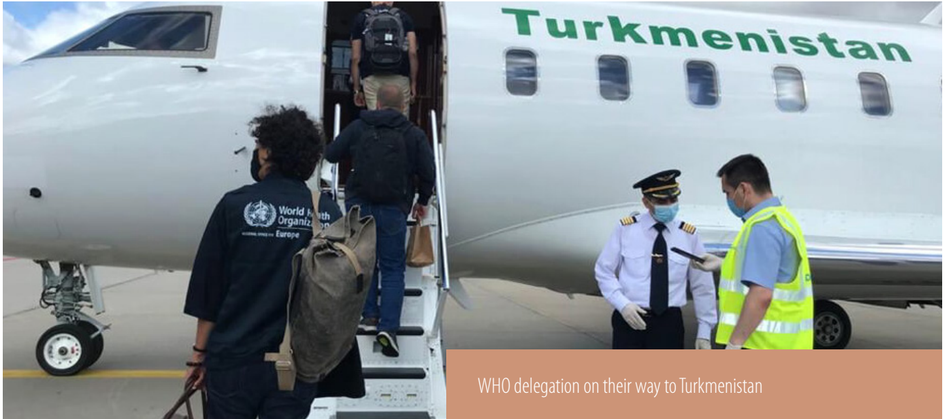
WHO delegation on their way to Turkmenistan