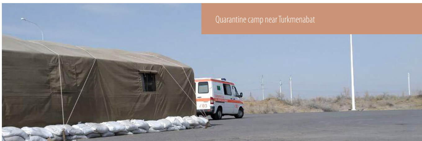
Quarantine camp near Turkmenabat

The food is monotonous, mainly rice and porridge. All the cooked food comes in plastic dishes, which are thrown away together with the remains of the uneaten food. The quality of the food and drinking water is poor, if not terrible. There are small stones in the low-grade rice.