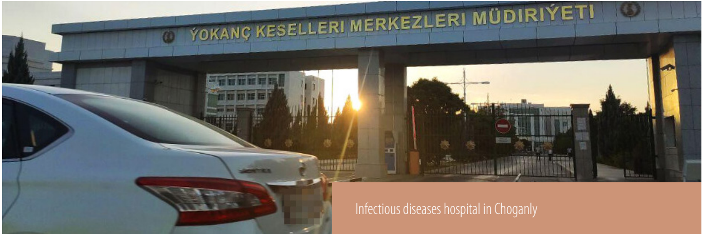
Infectious diseases hospital in Choganly