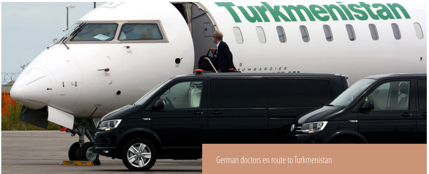
German doctors en route to Turkmenistan