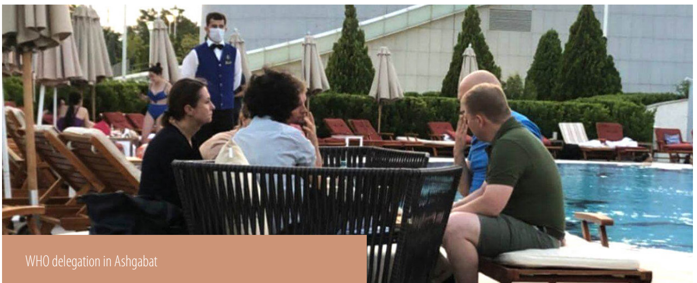
WHO delegation in Ashgabat