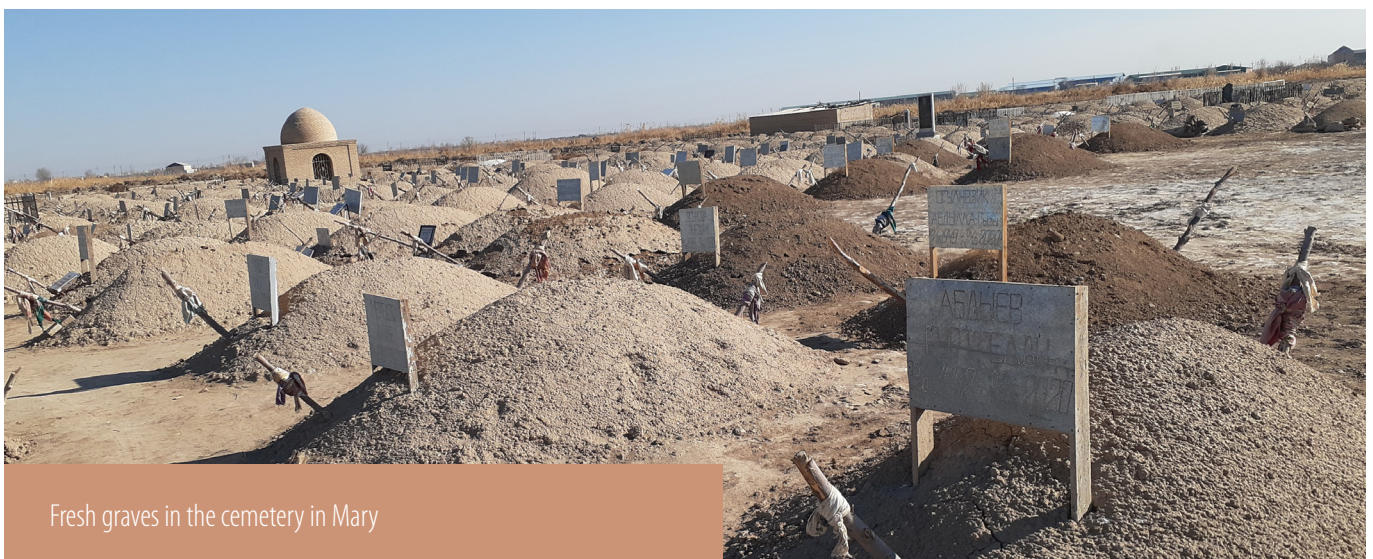
Fresh graves in the cemetery in Mary