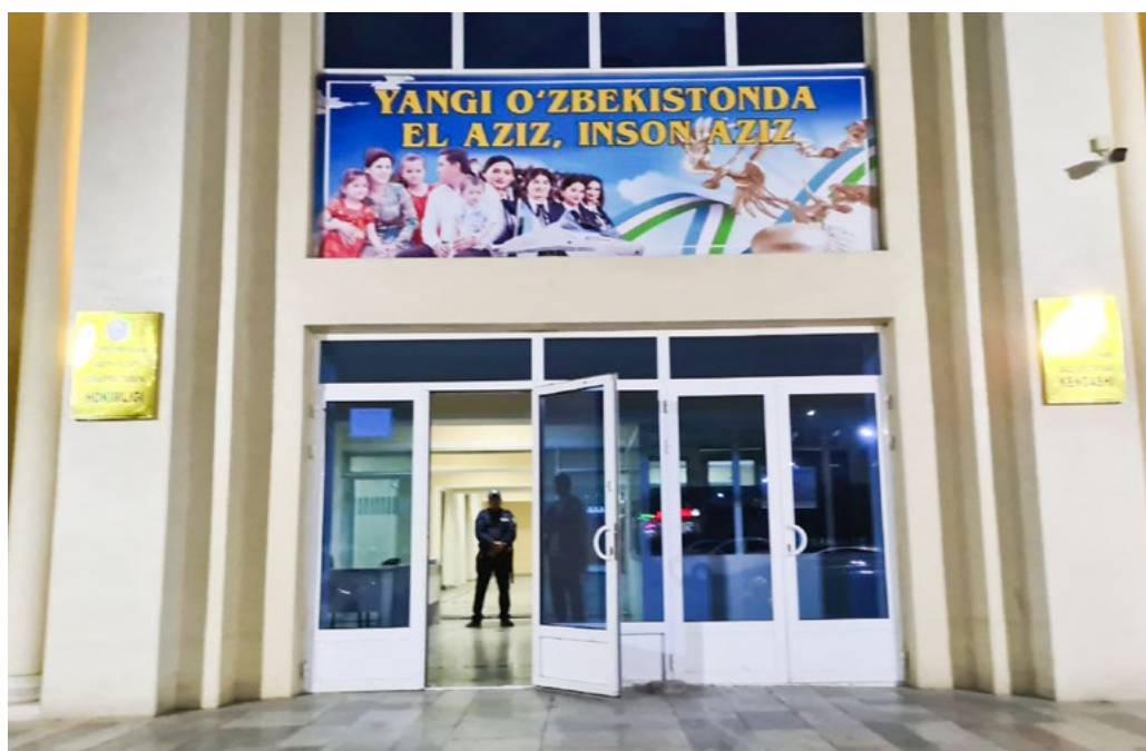
October 2022, Uchkuprik district hokimiyat where farmers were forced to “voluntarily” give up their land. Poster: “The new Uzbekistan values the nation and its people”.

Uzbek media has covered dozens of cases of illegal land confiscations, sometimes with positive outcomes after prompting interventions by the authorities.