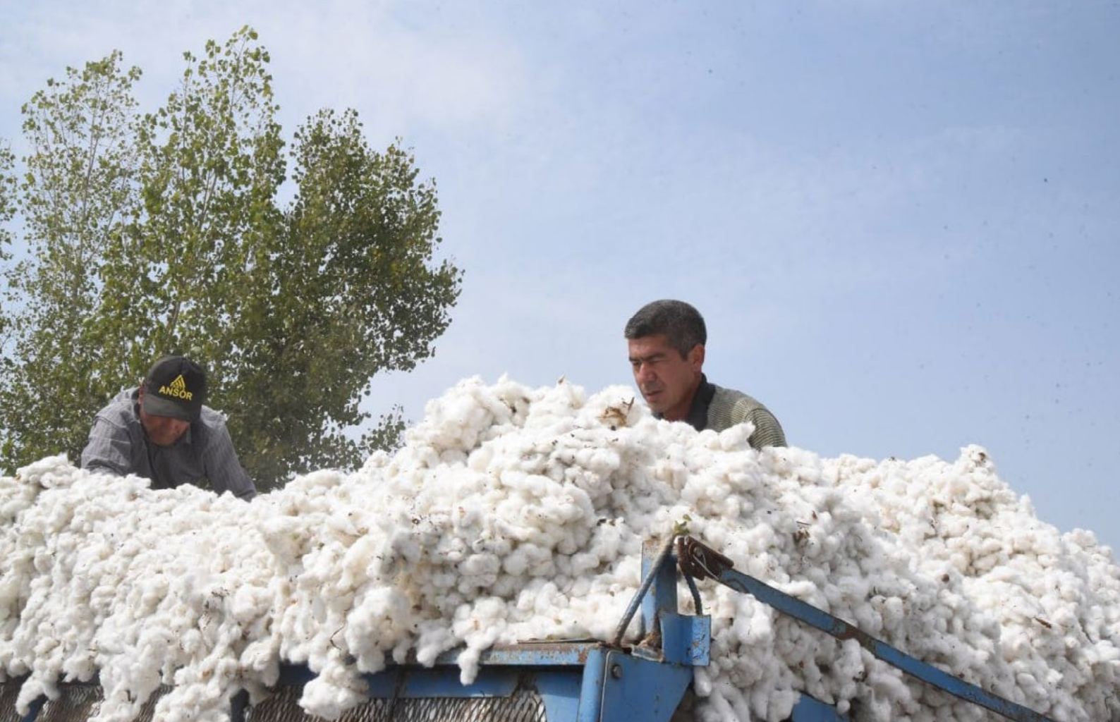
Cotton worker, Ferghana, 2022.

The absence of independent representative farmers' organizations leaves farmers particularly exposed to abusive practices. The Farmers' Council, although somewhat responsive to farmers' concerns in 2022, does not have the influence to effect changes to policy. This is best illustrated by the proposed recommended price for cotton in 2022 which cotton clusters were then able to ignore following appeals by the clusters to government officials. Given the unequal balance of power between farmers and cotton clusters, an independent farmers' association is urgently needed to protect the rights of farmers from illegal land confiscations and exploitative contracts.