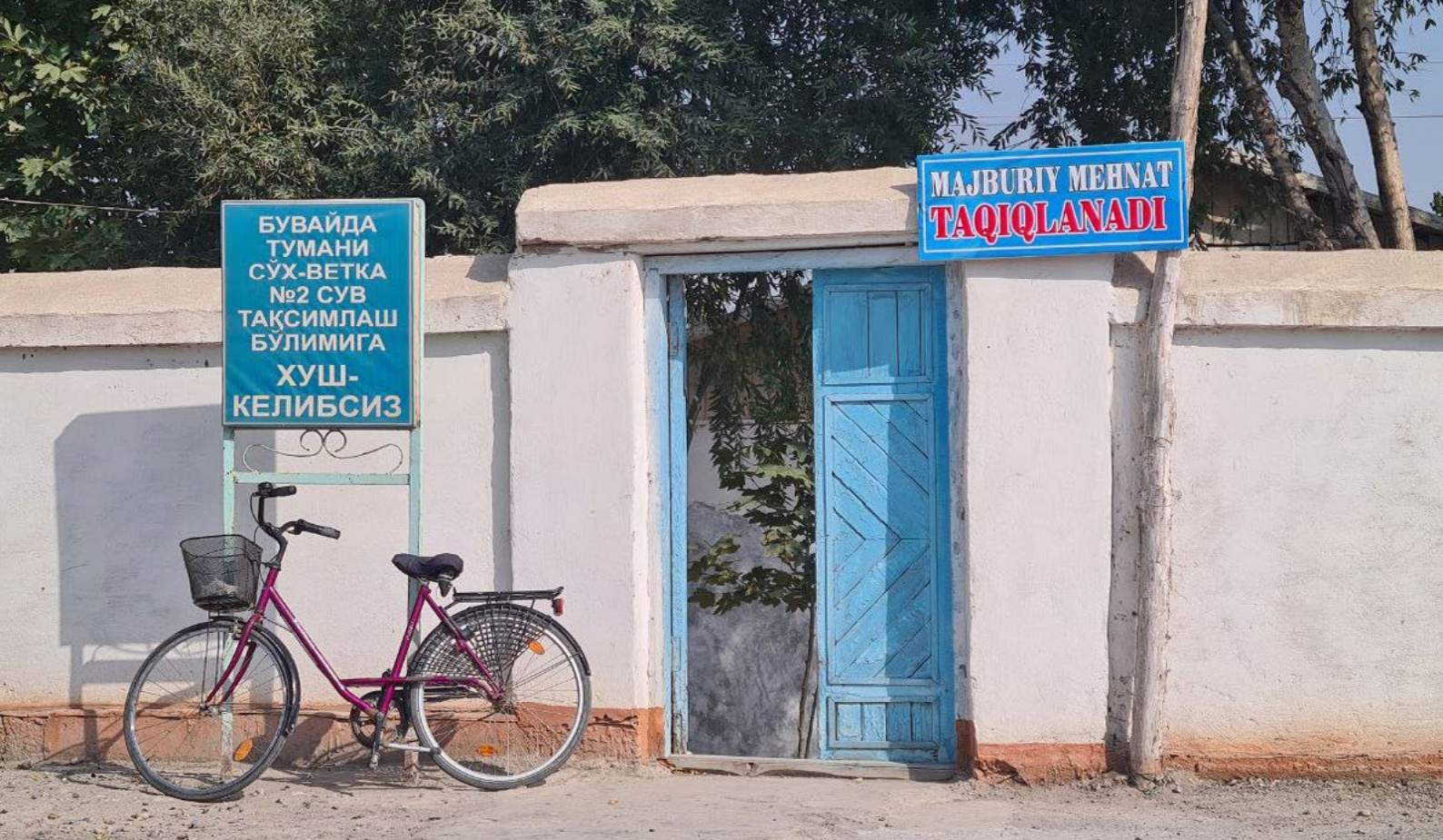
September 2022, Buvayda district, Fergana region. Poster at the entrance of the district water distribution organization: "Forced labor is prohibited".

The protocol reveals that comprehensive control over the cotton harvest is strictly centralized. For this purpose, "the Republican Information Center" (and its district and regional departments) was established "to coordinate, record, and analyze the ongoing work on the organization of the 2022 cotton harvest, as well as to promptly solve any problems that may arise."