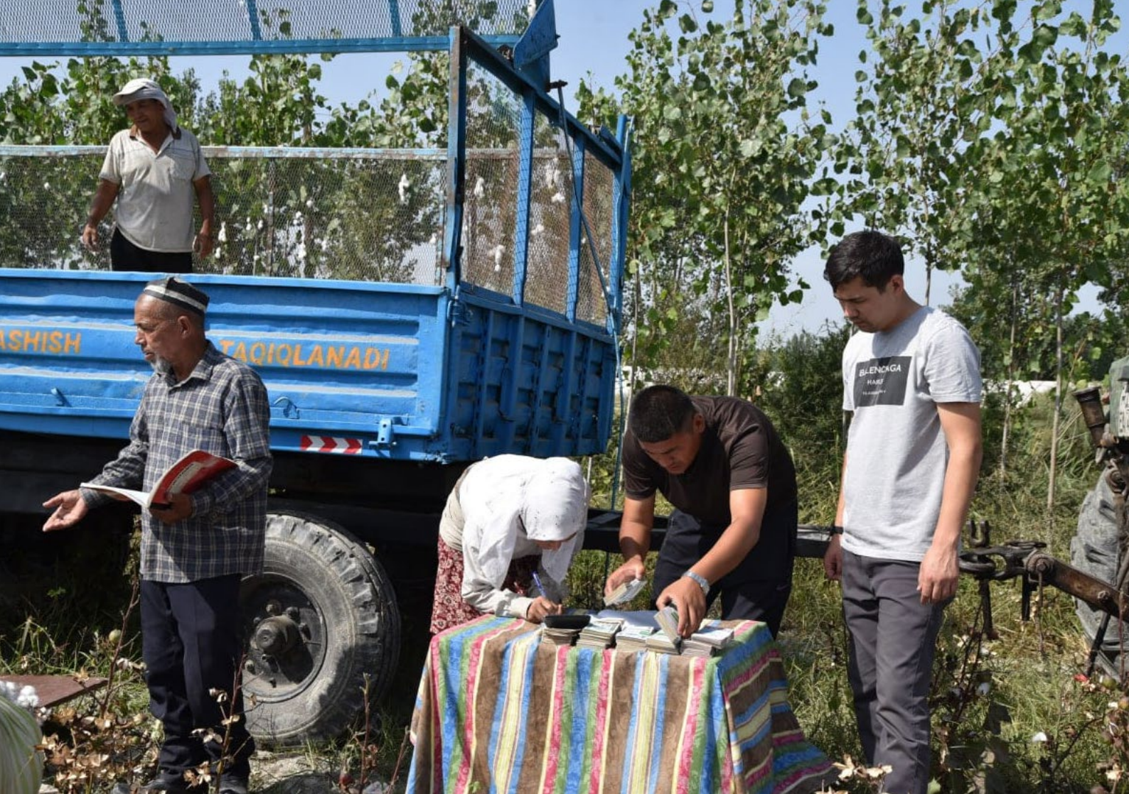
Cotton pickers collecting their wages, Ferghana region, September 2022.