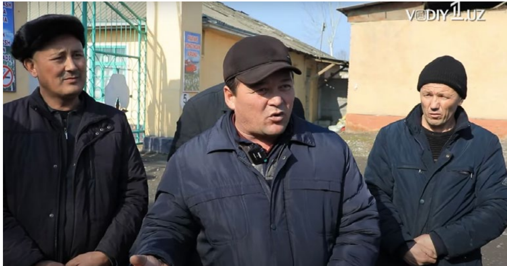
Farmers gather in front of cotton ginnery to demand payment, Ulugnor district, February 30, 2023.