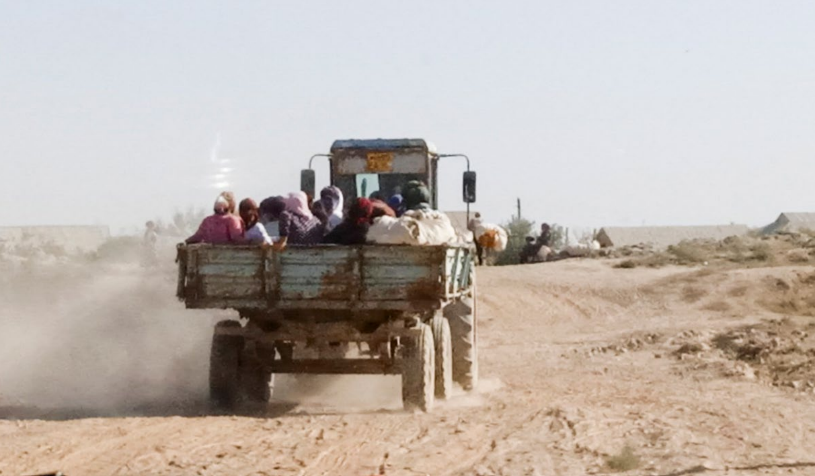
September 2022, Mirishkor district, Kashkadarya region. Cotton pickers going to the fields.