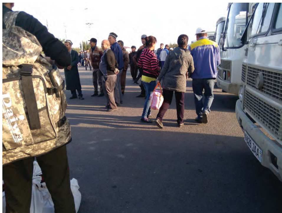
Employees of “Mubarak GQIZ” Ltd gas processing plant on their way to pick cotton. September 30, 2020, Kashkadarya region, Mubarak district.

Several employees from these sectors expressed a clear understanding that the picking burden on them had increased because of public commitments to avoid sending health and education employees to the fields. A water utility employee said “Am I picking of my own will? No, but this year they have freed the teachers and nurses and so the burden falls to us. All districts must mobilize pickers from public organizations.” 26 Similarly, a maintenance worker said, “Around 300 people work in the public maintenance department. All season we are picking cotton: street sweepers, cemetery tenders, guards, gardeners. In some districts the maintenance department employees up to 800 people. We are all in the fields from the beginning to the end of the cotton harvest. Especially now that teachers have been freed from picking, we are picking to make up for them.” 27