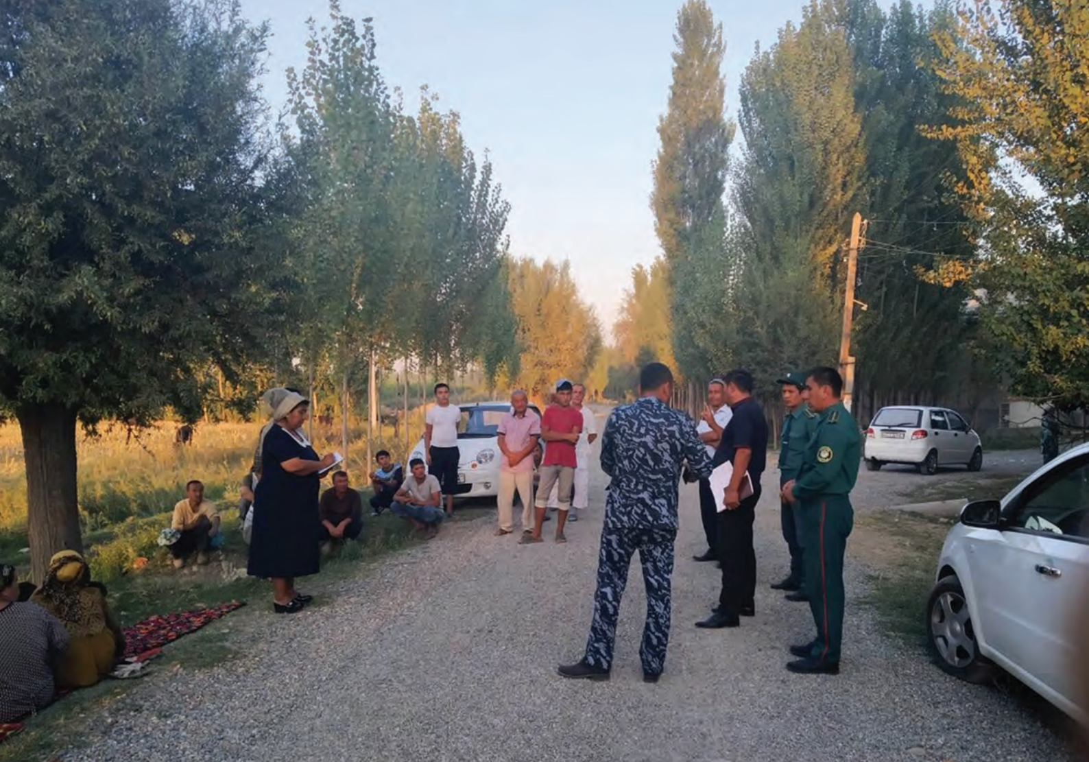
Police have traditionally been involved in picking cotton in Uzbekistan. During the 2019 cotton season, the police picked cotton while others had to hire cotton pickers and visit cotton fields to keep order. October 8, 2019, Namangan region.

Another mahalla recruiter said that it is very difficult to find sufficient pickers because most people who are willing to pick cotton are hired as replacement pickers, earning a replacement fee on top of what they earn from picking. He said that if the mahalla cannot find enough pickers they will face complaints from the authorities: “Every dog in the hokimiat will come to us to show its teeth.” 14 It is evident through documents and interviews that mahalla representatives were unable to recruit sufficient numbers of voluntary pickers without resorting to coercion. A document received by the mahalla leader from Buka district in the Tashkent region shows that already by October 3, after the first pass, mahallas, tasked with recruiting 10,047 pickers fell short by 2,471 pickers, nearly 25% of the required number. 15