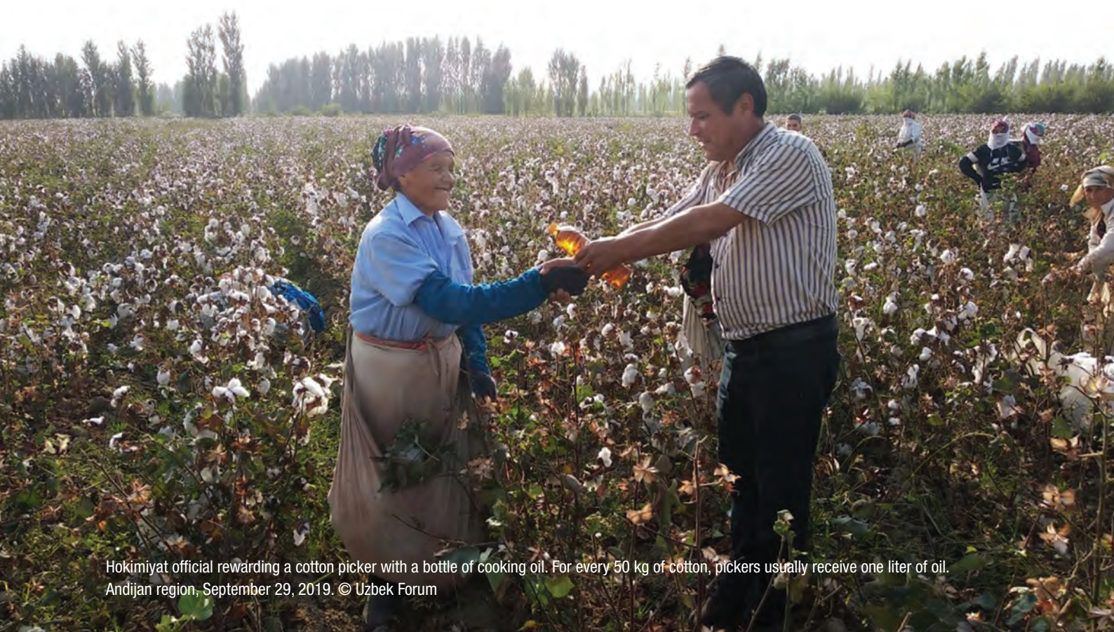
Hokimiyat official rewarding a cotton picker with a bottle of cooking oil. For every 50 kg of cotton, pickers usually receive one liter of oil. Andijan region, September 29, 2019.

Despite these positive trends, the 2019 harvest also showcased the deep challenges that remain in the effort to end forced labor in cotton production conclusively. Some structural drivers of forced labor, in particular the involvement of hokims in agriculture and the quota system, remained entrenched. These, combined with a lack of progress in developing alternative recruitment systems and weak accountability systems, resulted in significant use of forced labor throughout the regions Uzbek Forum monitored. Thus, the 2019 harvest reveals an inconsistent picture: the government’s commitment to ending forced labor is real and progress is meaningful, but government actions and policies also continued to drive forced labor in both government and privatized cotton-textile cluster production areas. 3