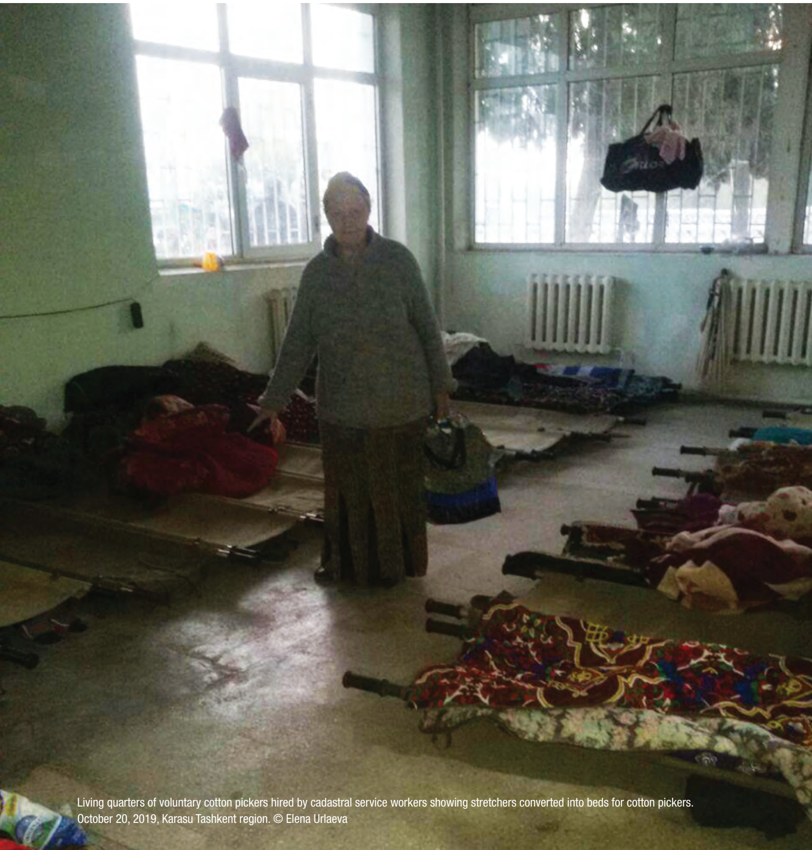
Living quarters of voluntary cotton pickers hired by cadastral service workers showing stretchers converted into beds for cotton pickers. October 20, 2019, Karasu Tashkent region.

Based on the survey responses, poor working conditions remain a problem in the cotton harvest. In terms of labor rights, the data clearly demonstrate that violations of human rights occurred, including physical assault and lack of proper access to food, sanitary facilities and clean water. For instance, a soldier interviewed by Uzbek Forum said that soldiers who did not pick the daily quota of 80 kilos could be beaten. 55 Another said that he bought cotton at inflated prices from other pickers to meet the quota otherwise he would be punished with extra work or made to do strenuous physical exercise at night. 56 In interviews with Uzbek Forum monitors some pickers complained about working and living conditions, especially poor and insufficient food, lack of access to safe drinking water, and hygiene facilities. 57 Physical insecurity and personal humiliation were both reported, as well as overwork and wage theft.