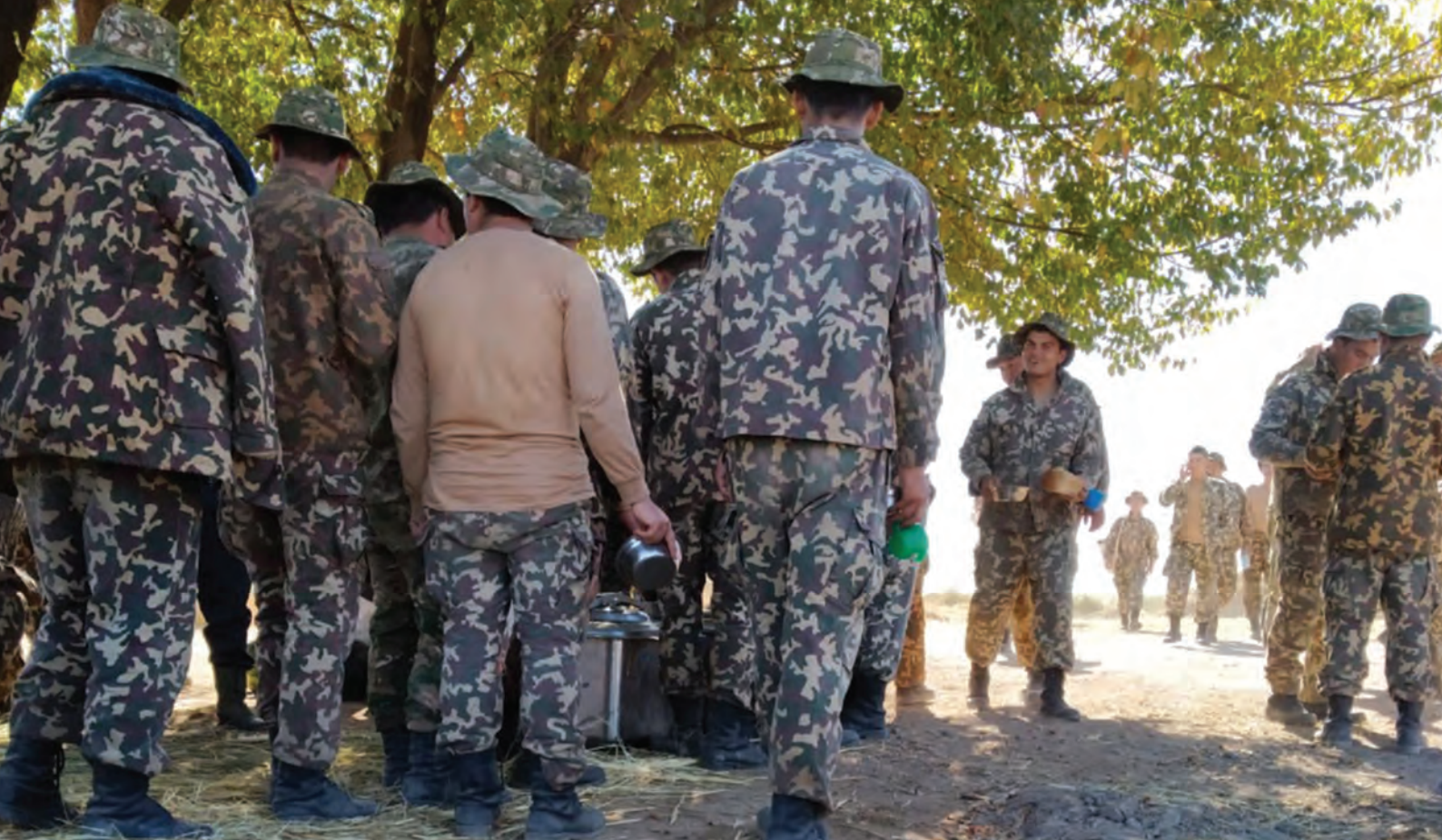
Soldiers undergoing one month's paid military training for enrollment in the "mobilization recruiting reserve" were sent to pick cotton for one month. Khorezm region, Shavat district, October 3, 2019.