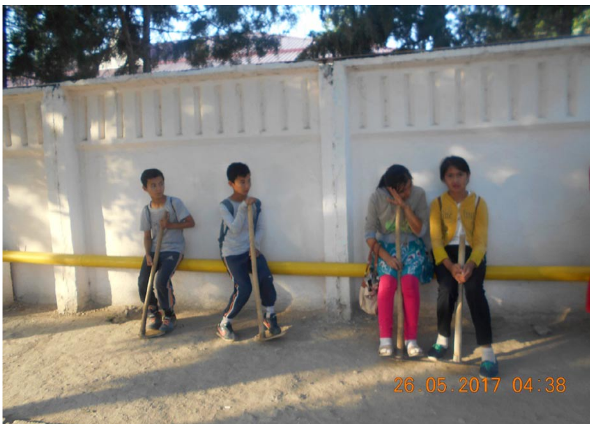
Children in Turtkul district, each holding a ketmen , a traditional weeding tool, and waiting for transport to the cotton fields. Many work in place of their parents. May 26, 2017