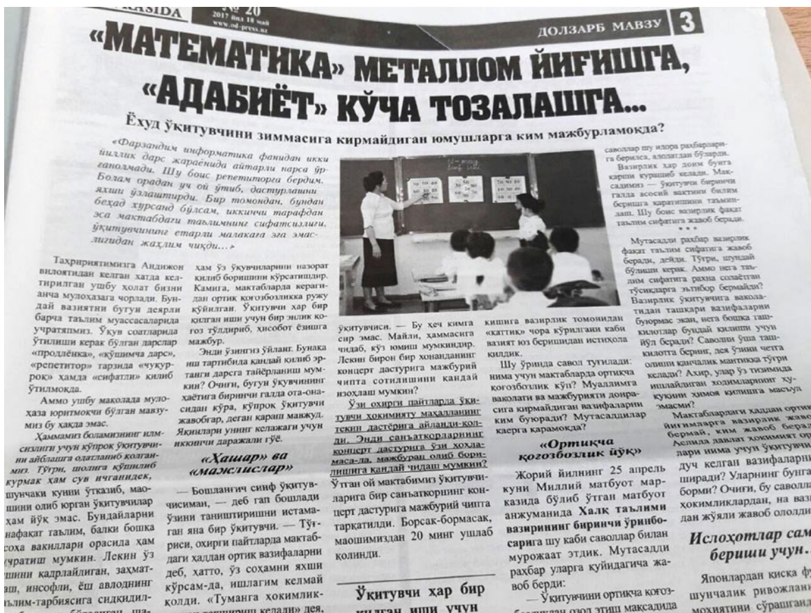
A local newspaper article on the constant forced labor of teachers in the agricultural sector. “Oila Davrasida”, May 19, 2017