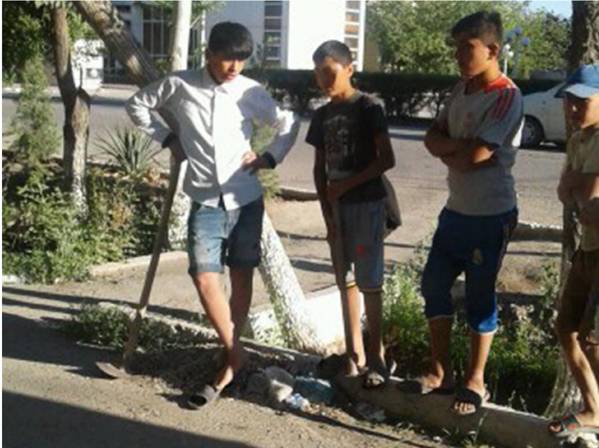
Children in Turtkul district, Karakalpakstan waiting for transport to work in the cotton fields. Children often work in place of their mothers who are required to work in the fields by their supervisors or mahalla councils. May, 2017