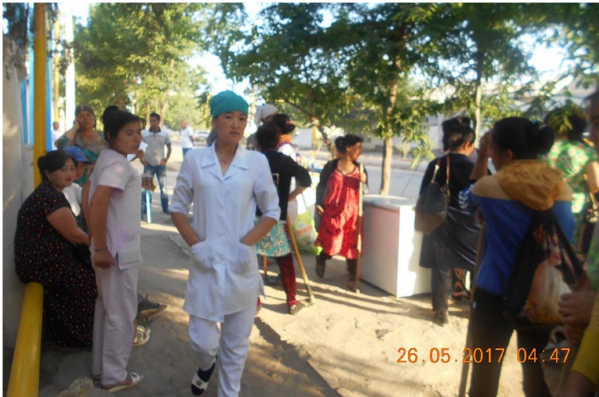
Medical workers are routinely required to weed the cotton fields. Jizzakh region, May 26, 2017

Others said they view complaining as useless or ineffective. 101 A schoolteacher said that there is “no use in complaining. You would only harm yourself.” 102