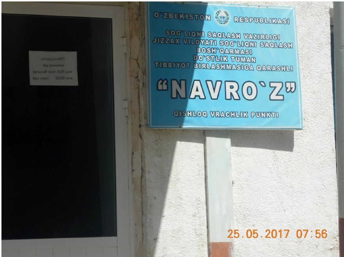
A medical center in Dustlik, Jizzakh region, whose employees were required to weed the cotton fields involuntarily, for no pay and under threat of dismissal in spring 2017. May 25, 2017