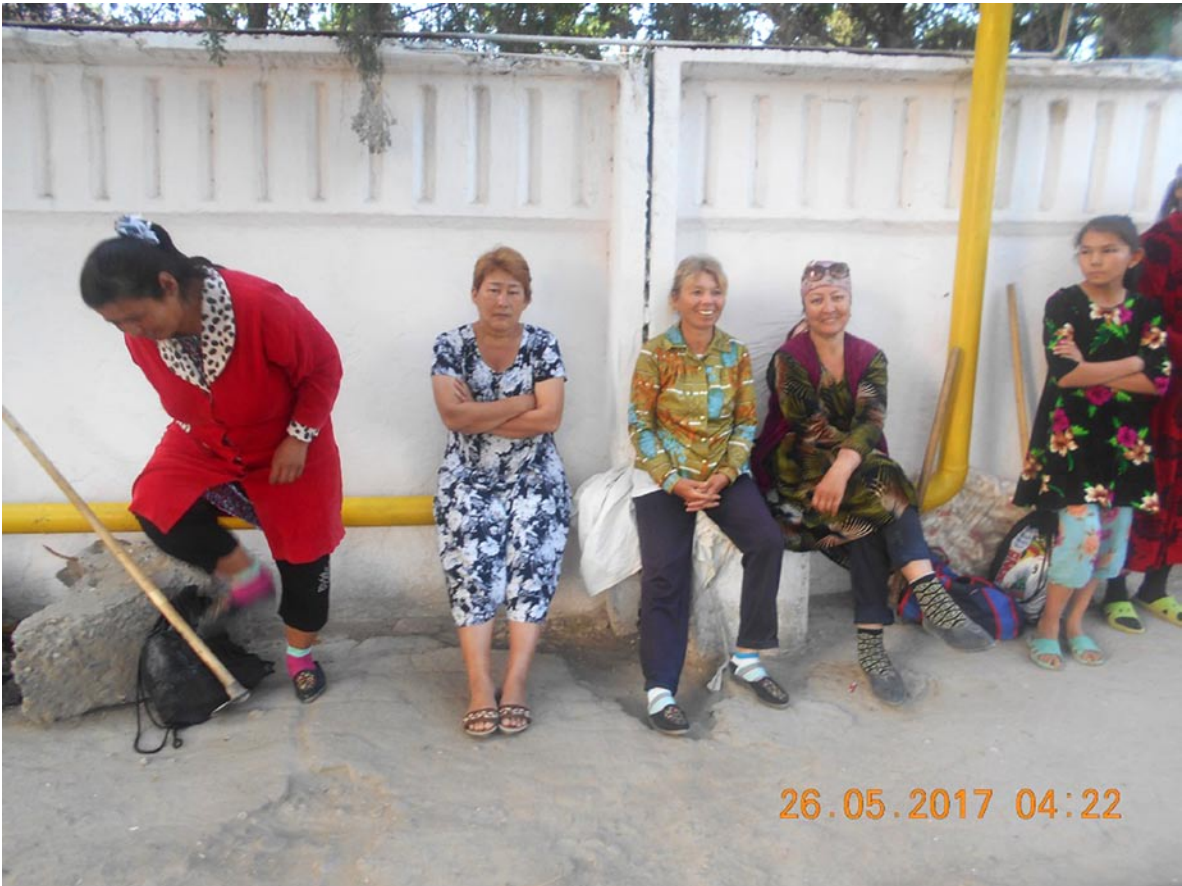
Employees of various state organizations waiting for public transport to go weed the cotton fields. May 2017

All the interviewees told the Uzbek-German Forum that spring fieldwork was arduous, and that they worked under the sun with temperatures that reached up to 40 degrees C (104 F). Many complained that farmers did not provide drinking water despite the heat. The length of the workday varied. Some people worked just a few hours a day and others worked up to 12 hours with a midday break. Nearly all workers had to provide for their own food and some also had to pay for transportation.