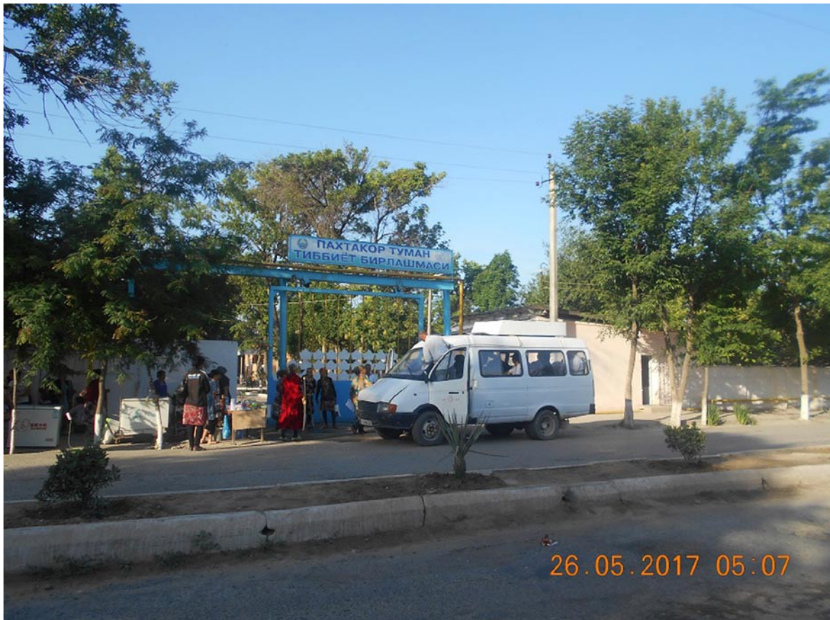
Hospital in Pakhtakor district, Jizzakh region whose employees were sent to weed cotton fields involuntarily in spring 2017

receive public benefits or a salary from a state organization. 36 In the sole exception, one college teacher negotiated to work for a farmer near his home because he did not want to be far from his child, who has serious medical problems, and the farmer agreed to pay him 250 kilograms of wheat for every three hectares he weeded. The rest of the teacher's colleagues worked in fields farther away and, as other public sector employees, received no salary. 37 In addition to receiving no pay, some people incurred in costs for spring fieldwork, for food and water. In some cases, people also had to pay for transportation. 38