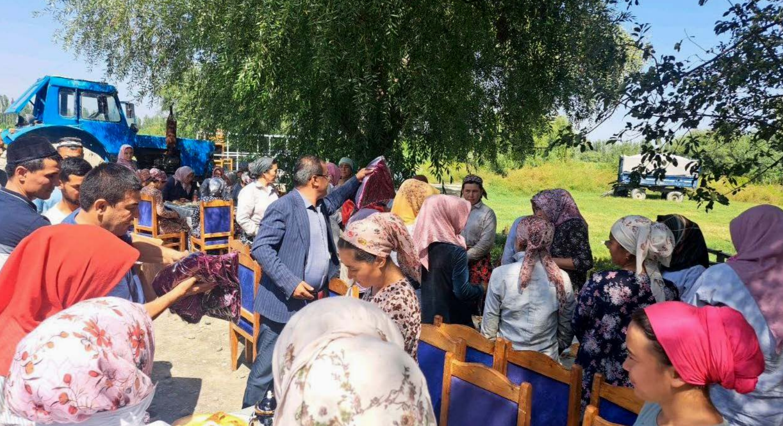
Bekzhoj Ibragimov, hokim of Buvayda district, Fergana region, distributing gifts to cotton pickers; September 8, 2023.

farmers who are attached to clusters. A farmer in Mingbulok district, Namangan region, who grows cotton as a member of a cooperative, said that their cotton is more profitable because the farmers collectively buy their products at market prices. 40