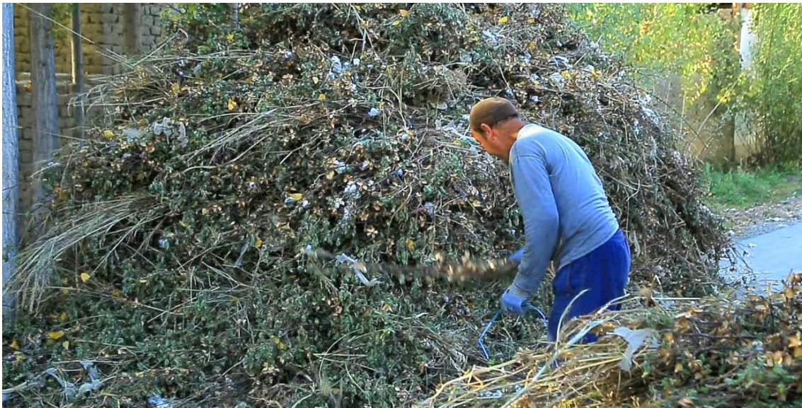
A farm worker transports cotton branches for heating in households. Andijan region, November 2023.

In mid-September, a leaked video 8 of a Zoom conference held by Shukhrat Ganiev went viral on the internet. During the meeting, the presidential advisor reprimanded the hokims of lagging regions for low rates of cotton harvesting and insufficient numbers of mobilized pickers. Ganiev’s speech implied that several regions could not mobilize tens of thousands of people to pick cotton and were significantly behind with the cotton harvest schedule. In particular, he remarked, “Out of 220,000 required pickers only 140,000 went out in Kashkadarya and only 100,000 out of the required 160,000 went in Bukhara.” During the meeting, Ganiev threatened the heads of the regions with criminal prosecution for failing to organize a timely and successful harvest: “Fergana, you have to harvest 11,500 tons according to the schedule. Only 8,300 tons have been harvested. Besharik, Baghdad, Yazavan, Rishtan, Kushtepa, Uzbekistan — summon the hokims to the prosecutor’s office. Open a criminal case against the hokim of Kuva district...”